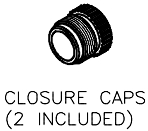
CLOSURE CAPS (2 INCLUDED)